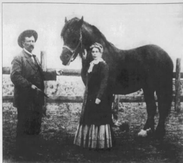
Mystery photo: This week's mystery photo was found in the Fitzgerald house when it was torn down in 1970. Does anyone recognize the man, woman or horse? Anyone who can help identify

Saturday, October 31, 1992 ELKO DAILY FREE PRESS, Elko, Nevada 5